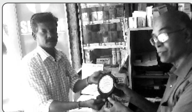
Suresh Medical, Madurai