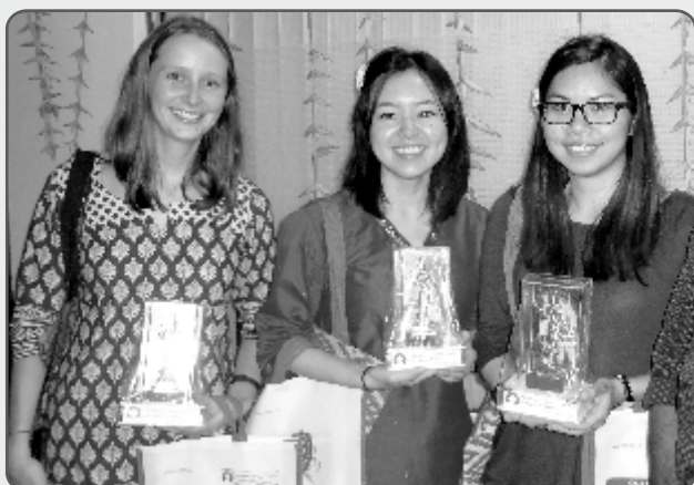
Students from Harvard University, USA visited MMHRC.