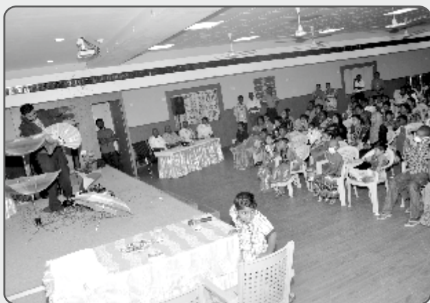
Camila Children's Cancer Centre family get-together program was conducted on 24.01.2016 at MMHRC.