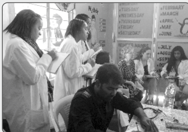
During their premedical internship, they participated rural health camps.