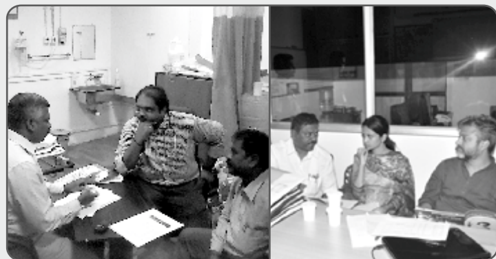
Team from Shine NGO & National Centre for Disease Control, New Delhi visited our hospital & inspected RNTCP (Revised National Tuberculosis Control Program).