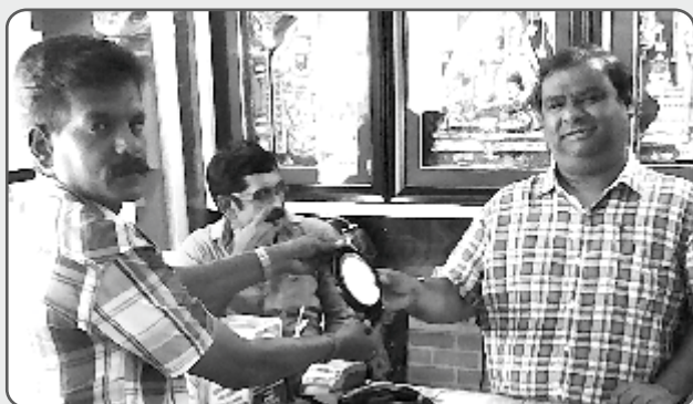
Raja Barley Biscuit Co, Madurai