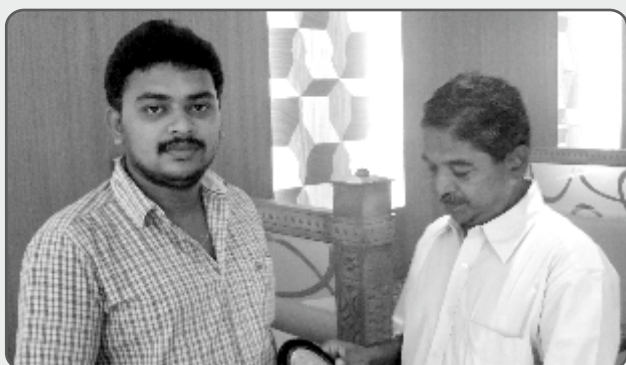
Hotel Shree Lakshmi Bhavan, Madurai