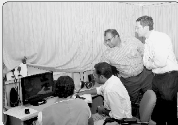
Team from Medtronic, US visited our hospital