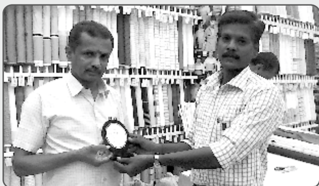
A K Ahmed and Co, Madurai