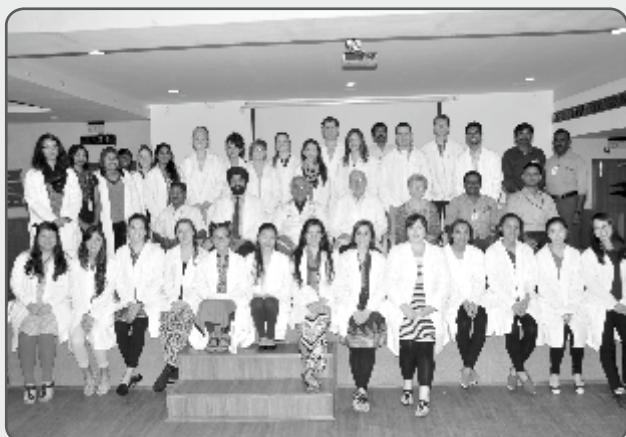
Students from university of IOWA, USA completed their pre medical internship at MMHRC.