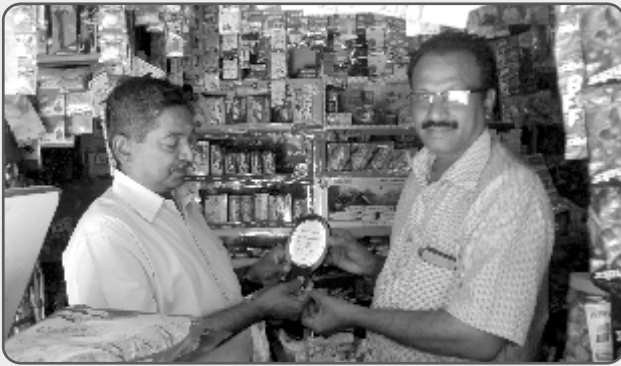
Jeya Store, Madurai