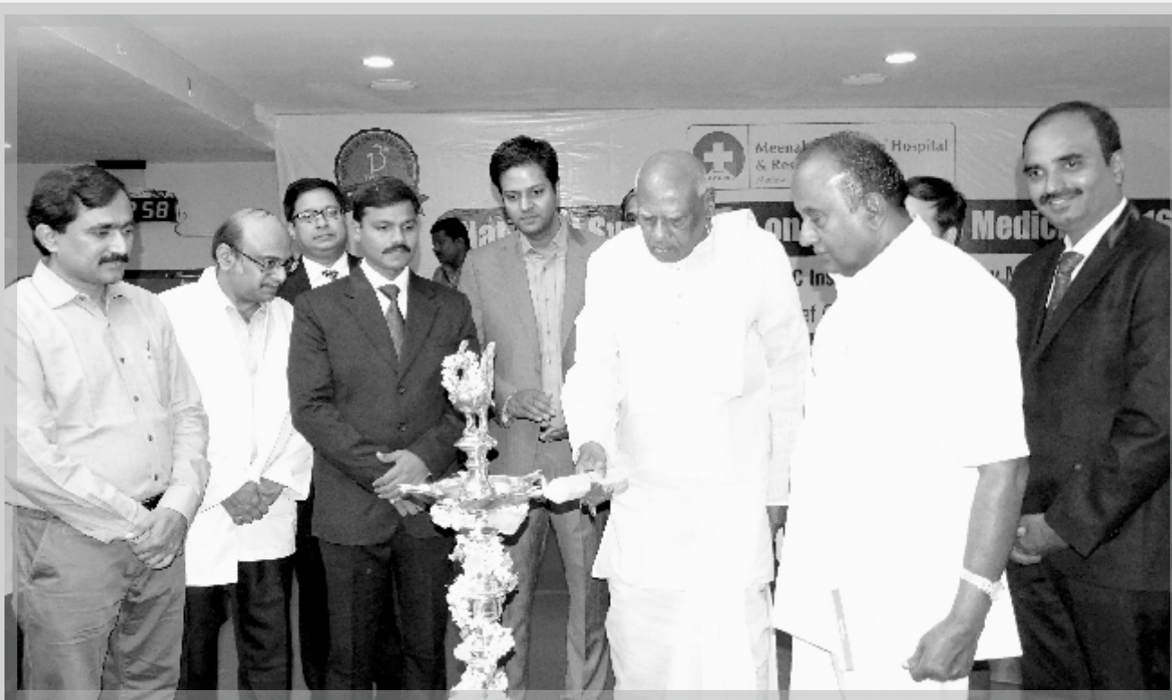
MMHRC Institute of Emergency Medicine organized a National Symposium on Emergency Medicine 2016. His Excellency Dr.K.Rosaiah , The Governor of Tamilnadu lighting the Lamp.