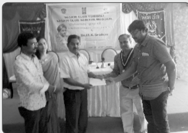
Vasavi Club, Madurai donated Rs.20,000/- (Life time donation) to MMHRC for cancer children.