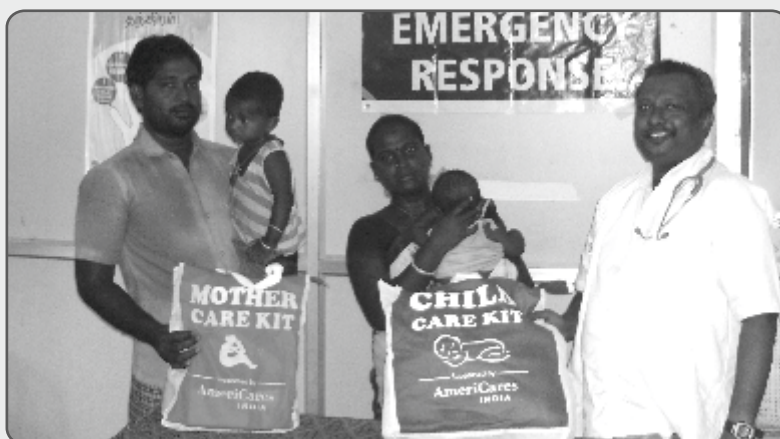
Received Mother & Child Care Kit from AmeriCares India, USA to the people affected in the Chennai Flood.