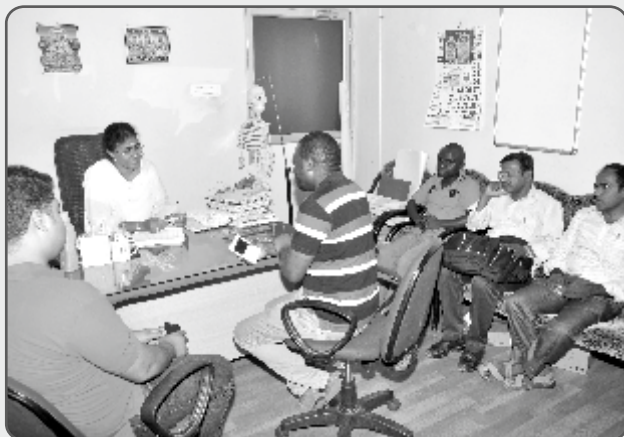
Team from Gango Africa visited our hospital