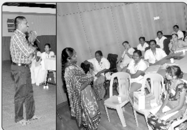
Educational Instructor – RNTCP, Govt. of Tamilnadu gave orientation to our staff about TB.