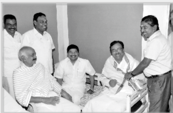
MMHRC honored Mr.E.V.K.S. Elangovan , Former, Tamilnadu Congress President during his visit to our hospital.