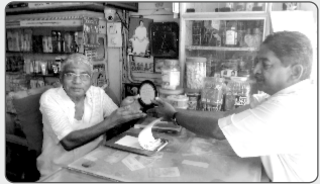
Latha Store, Madurai