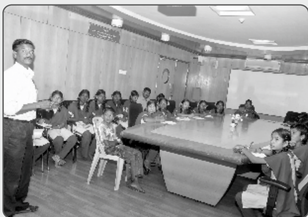
Orientation were given to Students from Boys Town Society, Thirumangalam.