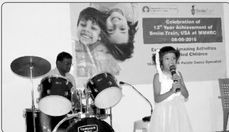
Celebrated 13 th year achievement of Smile Train, USA