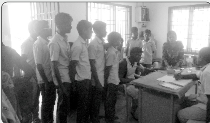
General Health Camp conducted at Pulicat, Chennai by MMHRC & Women's Welfare Syndicate

In addition to treatment, the crew also provided medical awareness and counseling, so that the victims may stay infection free in the post flood environment which is highly infectious.