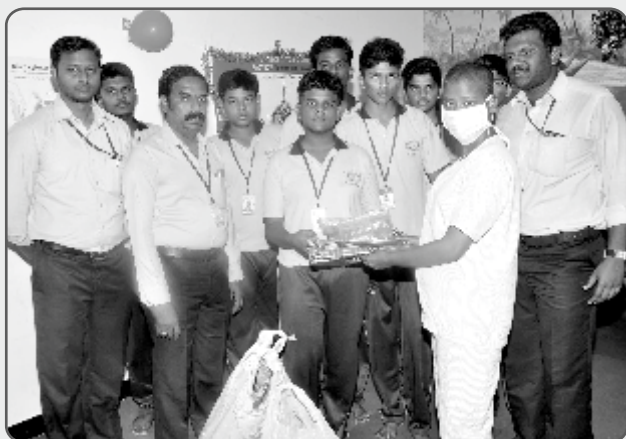
CEOD School Students visited & distributed the Hygienic Kit to our patients at MMHRC.