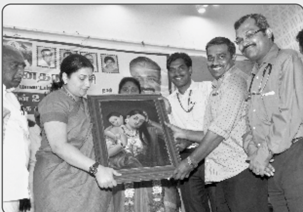
MMHRC hosting Smt.Smriti Irani , Minister for Textiles, Govt. of India during her Madurai visit.