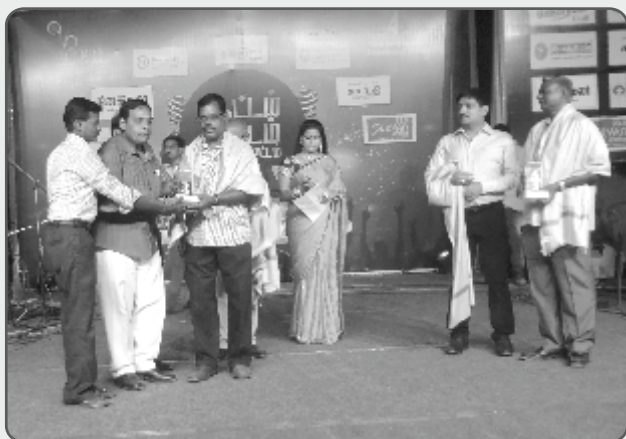
MMHRC honored Advertisement Association Office bearers during the Cultural Events