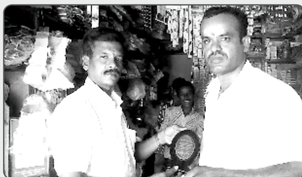
Boomirajan Stores, Karunkalagudi