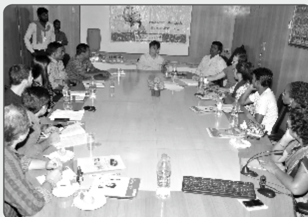
A team from Yale University, USA visited MMHRC and discussed about Telemedicine service.