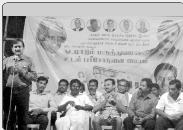
Orientation program was conducted for local village leaders about Mobile hospital scheme