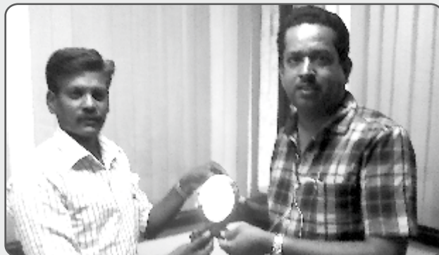
Deepam Color Lab & Studio, Madurai