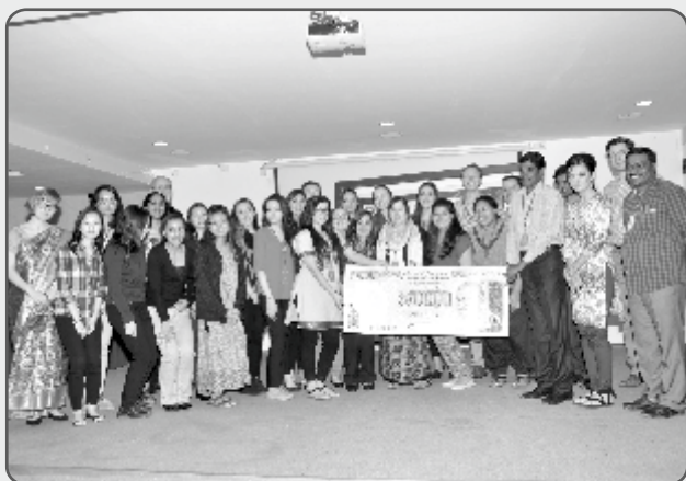
University of IOWA students donated Rs.42,000/- for Chennai Flood Relief.