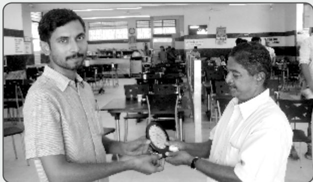
Hotel Gowri Krishna, Madurai